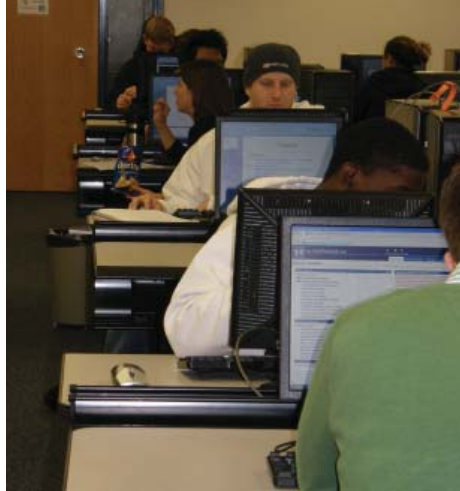
Students using the Timberwolf Learning Resource Center in lower Strosacker

a. Know yourself. When are you most energetic and alert? Plan to do the bulk of your studying during those times, especially in your more difficult subjects.