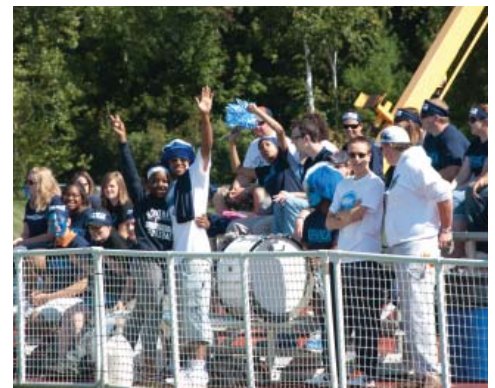
Football fans at the NU vs. Hillsdale game

Check out an updated schedule of all sporting events at timberwolves.gonorthwood.com .