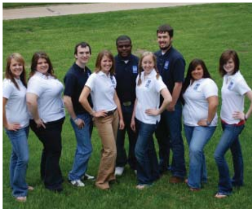
2009-10 Student Government Association E-Board